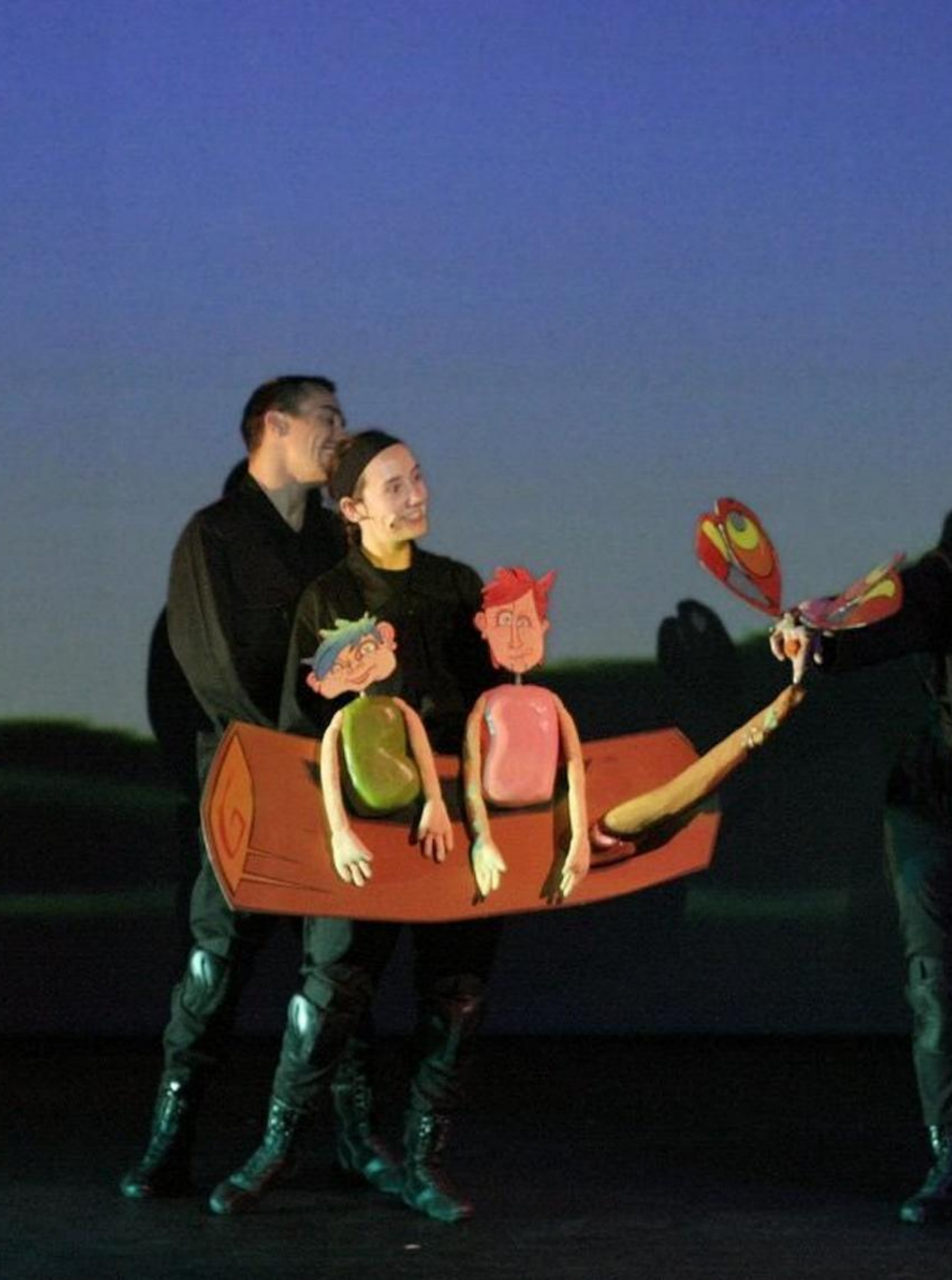
• ANDAR NAS NUVENS •